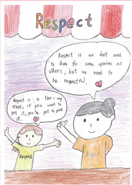
3rd Prize 4A WONG PUI CHING