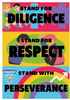
1E LAU SUNG CHING