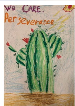
1E CHAN JOELLE