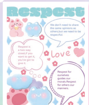
5E CHEUNG TIN CHING