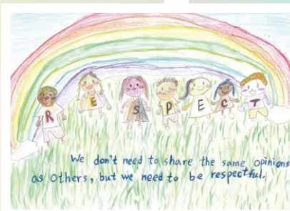
2D PUN PAK TSING