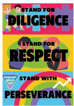
1E LAU SUNG CHING