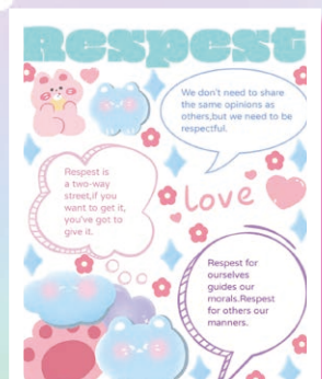
5E CHEUNG TIN CHING