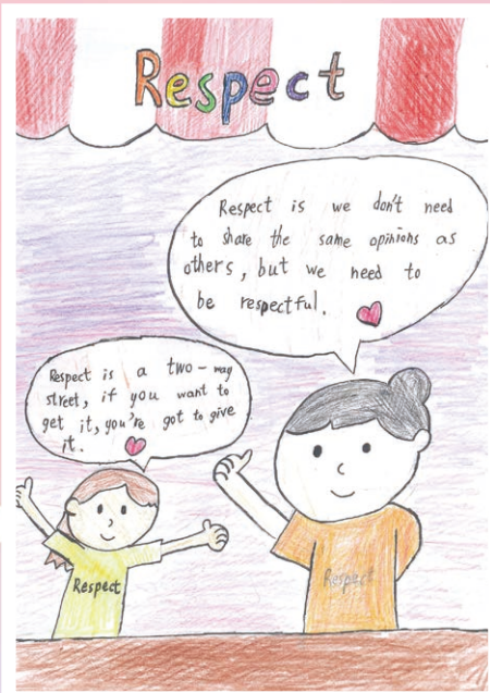
3rd Prize 4A WONG PUI CHING